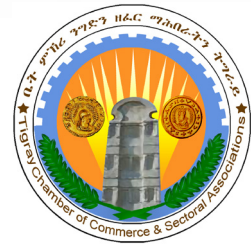
የትግራይ የንግድና የዘርፍ ማህበራት ም/ቤት Tigray chamber of Commerce & Sectoral Association