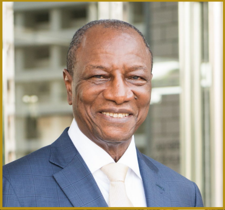
HEM the President of the Republic of Guinea, Professor Alpha Condé

The event is organized by the Private Investment Promotion Agency (APIP-Guinea) in collaboration with the African Development Bank (ADB) and the World Bank through its subsidiary the International Finance Corporation.