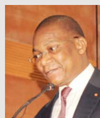
SE Bruno Nabagné Koné Ministre de la Poste et des TIC Côte d'Ivoire

«Ce Forum permet aux acteurs africains d'échanger... Comme vous le savez il faut montrer à nos populations que les TIC sont une opportunité qui peut contribuer au développement de nos pays ...et ce genre de Forum permet d'enfoncer le clou, d'informer la population et de sensibiliser les acteurs publics (les Etats) de façon à ce qu'ils prennent les dispositions pour créer le cadre qui permet à ces technologies de produire tous leur effets.»